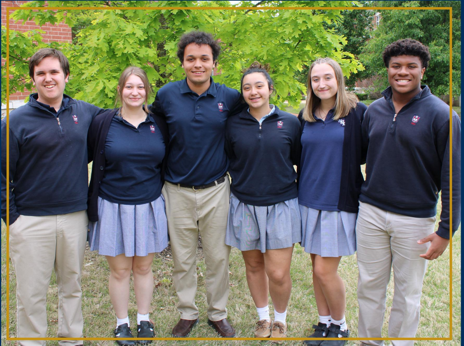
Graduates of St. Ann and St. Benedict at Auburndale