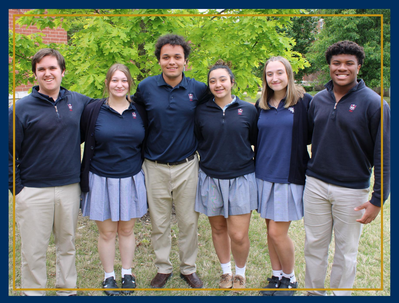
Graduates of St. Ann and St. Benedict at Auburndale