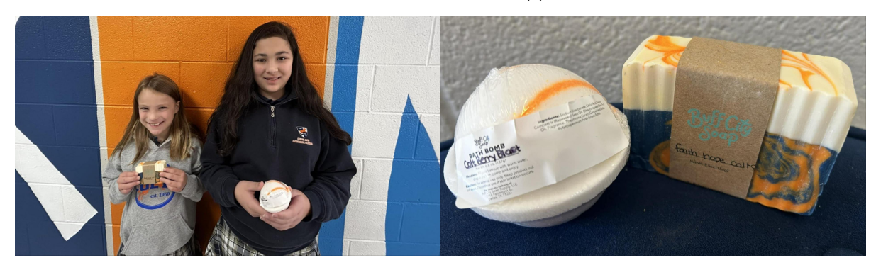
Click here to order soap